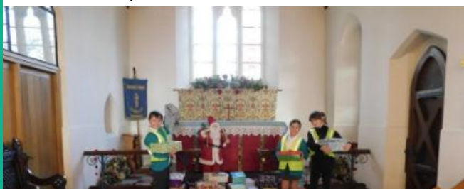
Operation Christmas Child